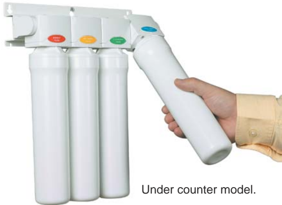
Under counter model.

Your Watts authorized dealer can provide you with a full range of water quality improvement products for drinking water applications. This equipment includes reverse osmosis systems, ultraviolet light disinfectant systems, the Watts® microbiological filter, under counter filters, whole house cartridge filters, whole house ROs and pre and post filters.