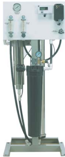
Whole house model.

Recognized as the best technology to remove the widest spectrum of drinking water contaminants. Under counter and whole house models are available.