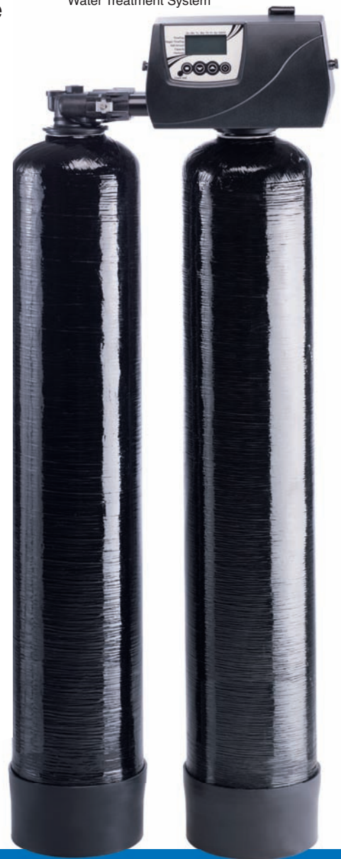
ProSense™ Water Treatment System

The ProSense™ Professional Water Treatment System by Watts® is designed for a planet that can no longer take water for granted. In an environment where the quality of a home's water can vary significantly... even from day to day... the ProSense™ System delivers conditioning performance that's completely consistent. Better still, it does so while saving regenerant and using less water. And it's great for our planet!