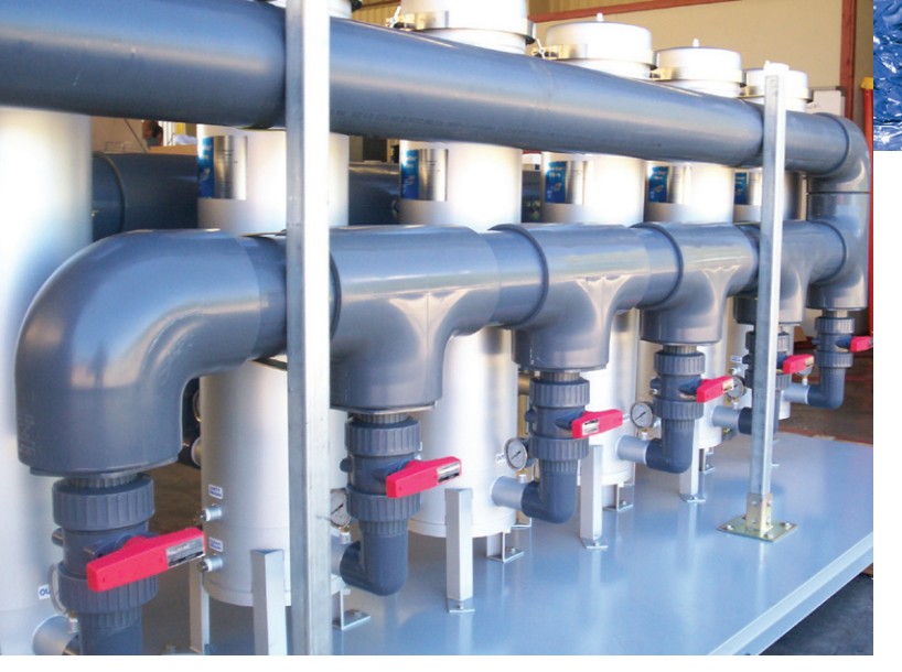
Custom Skid Mounted Pre-plumbed Cartridge Filter System