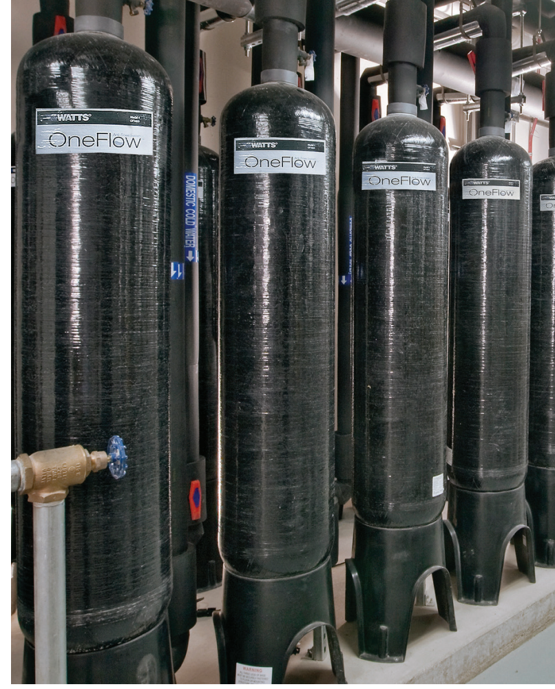
Multi-tank Parallel OneFlow® Scale Control System