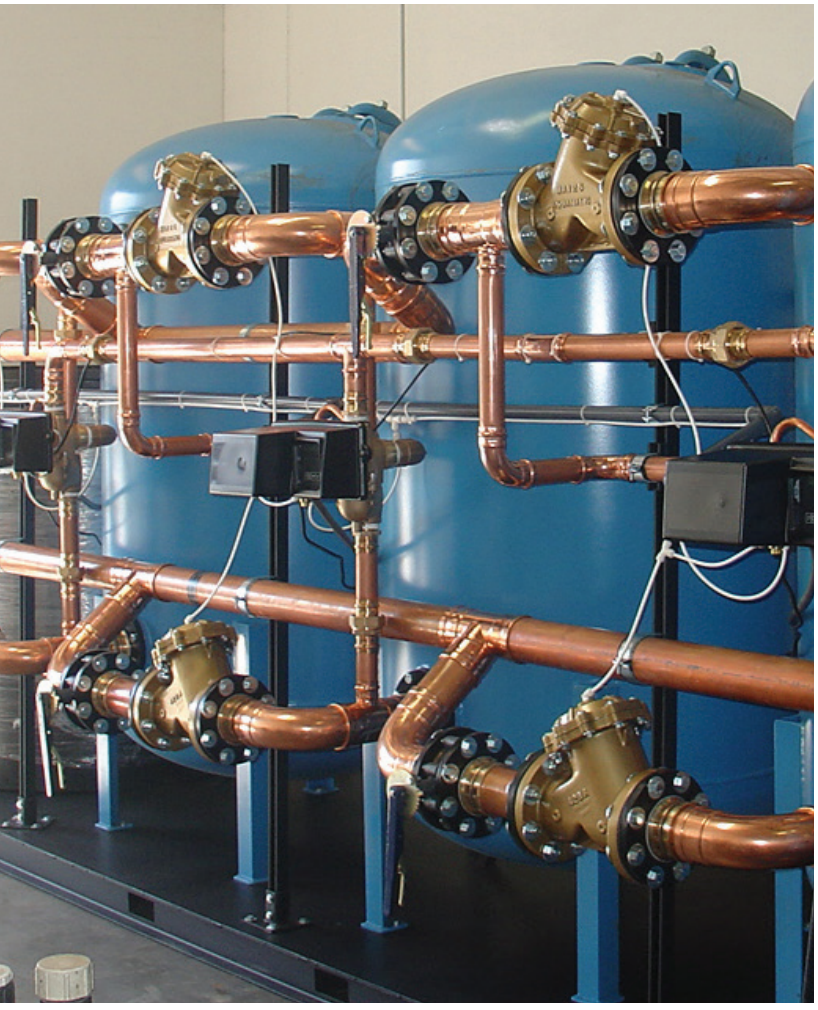
System Shown with Optional Propress® Fittings

ProPress® is a registered trademark of Viega GmbH & Co.