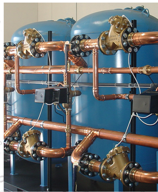
System Shown with Optional Propress® Fittings