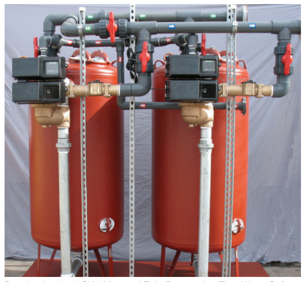
Pre-plumbed and Skid Mounted Twin Progressive Flow Water Softener

The Result: One source for efficiently engineering high-quality systems, and assistance with installation and start up.