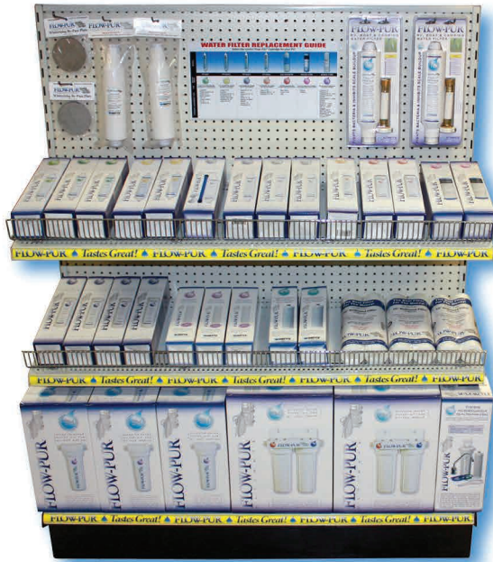
4 Foot End Cap "Premium Starter Package"

10 Minute Quick-Start Training Session For Your Staff Included!