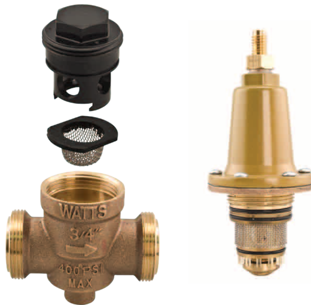
X65B Rough-in Kit