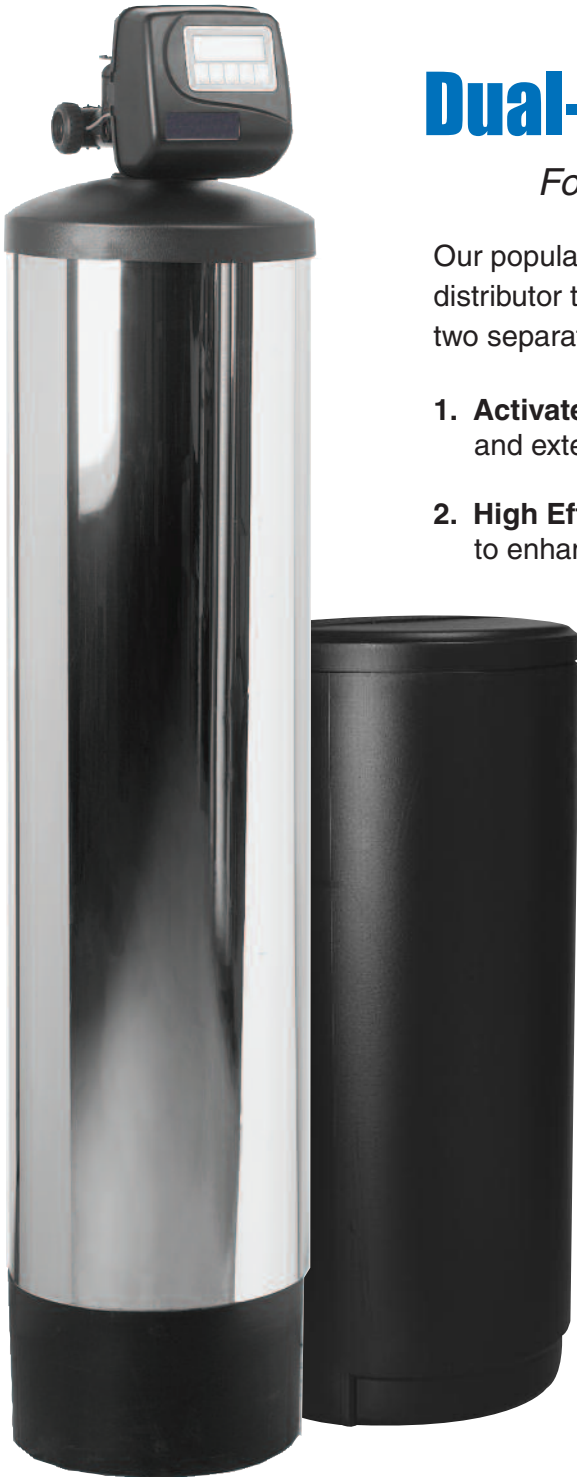
Shown with optional stainless steel jacket