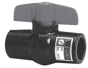
Watts Series PBV-S